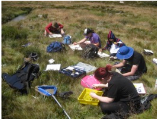
Sorting aquatic macroinvertebrate samples