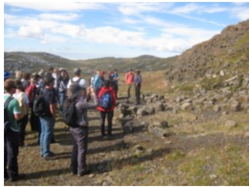
Geology of the High Plains– 'Ruined Castle'