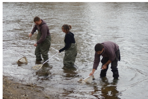
Stream edge sampling for aquatic macroinvertebrates