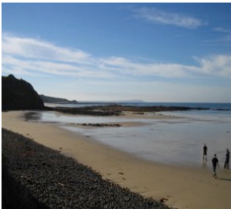
Woolamai wave platform