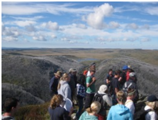
Bogong Moth habitat, Mt McKay