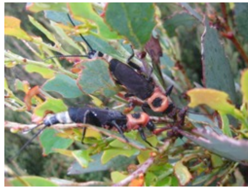
Alpine stonefly, endangered species