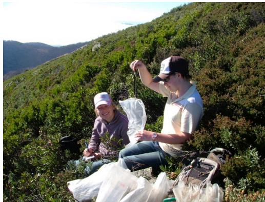
Sampling leaf litter in alpine vegetation communities