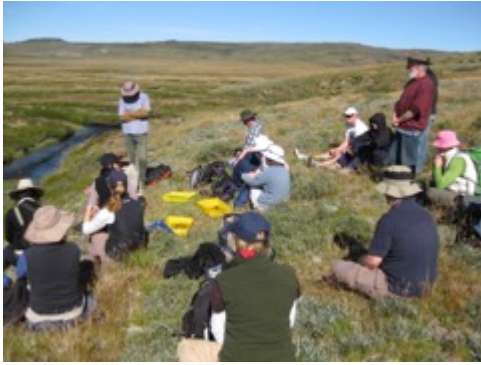
Stream ecology theory in the field