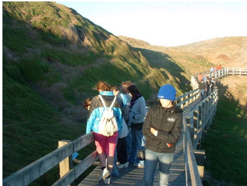
Penguin rookery at Philip Island