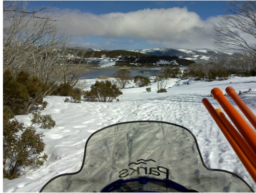
Aquatic Research in an extreme environment