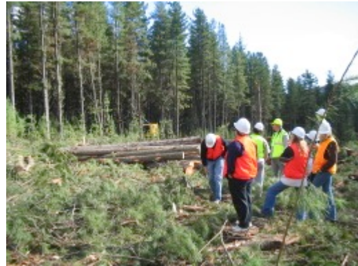
Harvesting of plantation pines at Shelley