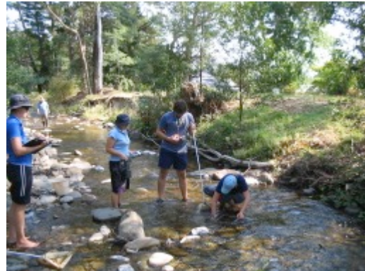
Students sampling in stream.