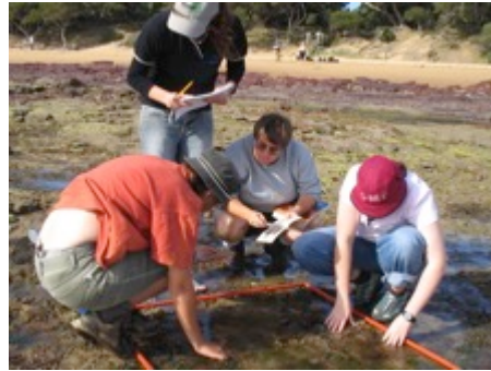
Quadrat sampling at Red Rocks, Phillip Island