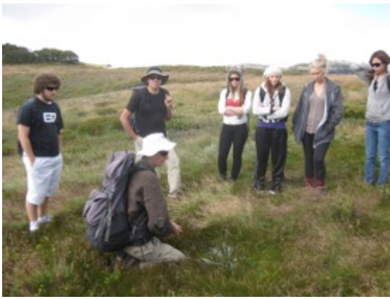
Vegetation in peatlands