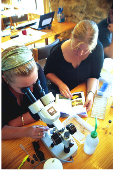
Identifying aquatic macroinvertebrates