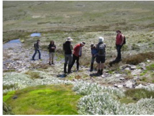
Alpine pavement morphology