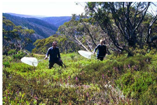
Collecting terrestrial invertebrates