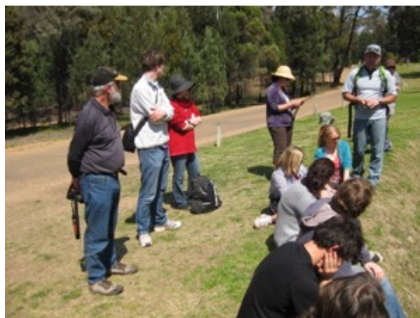
Conservation by Taronga Zoos.