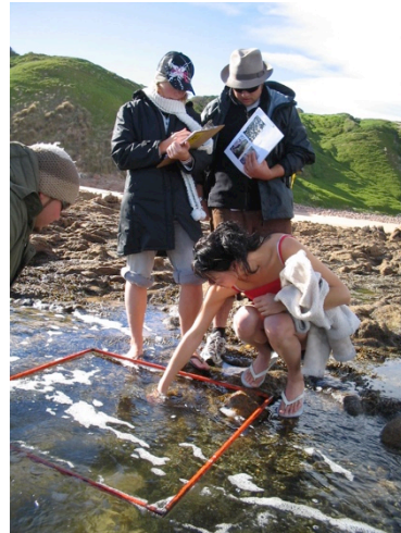
Quadrat sampling at Woolamai wave platform