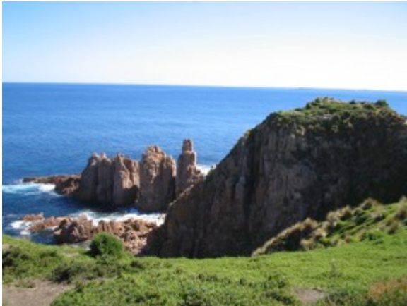
Cape Woolamai, Philip Island