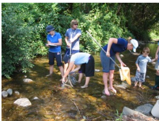
Students sampling stream macroinvertebrates