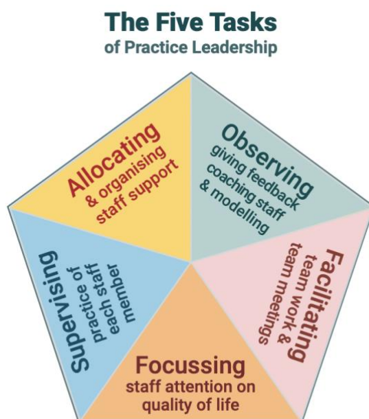
Figure 4. Five tasks of Frontline Practice Leadership