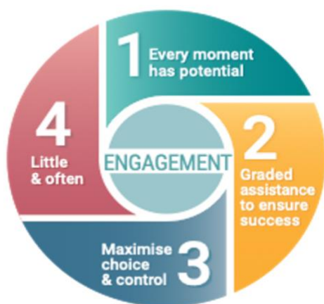
Figure 2. Four essentials of Active Support

The most recent versions of the Active Support training materials reduced the emphasis on paper-based activity or opportunity plans to avoid the focus shifting from practice to paperwork and box ticking, which had been observed as a tendency in some services. Training developed by the Tizard centre translates the theories that underpin Active Support into ‘the four essentials’ of practice taught to frontline staff (Beadle-Brown, Murphy, & Bradshaw, 2017) and Australian training follows a similar approach ( https://www.activesupportresource.net.au ). The four essentials of Active Support are represented in Figure 2.