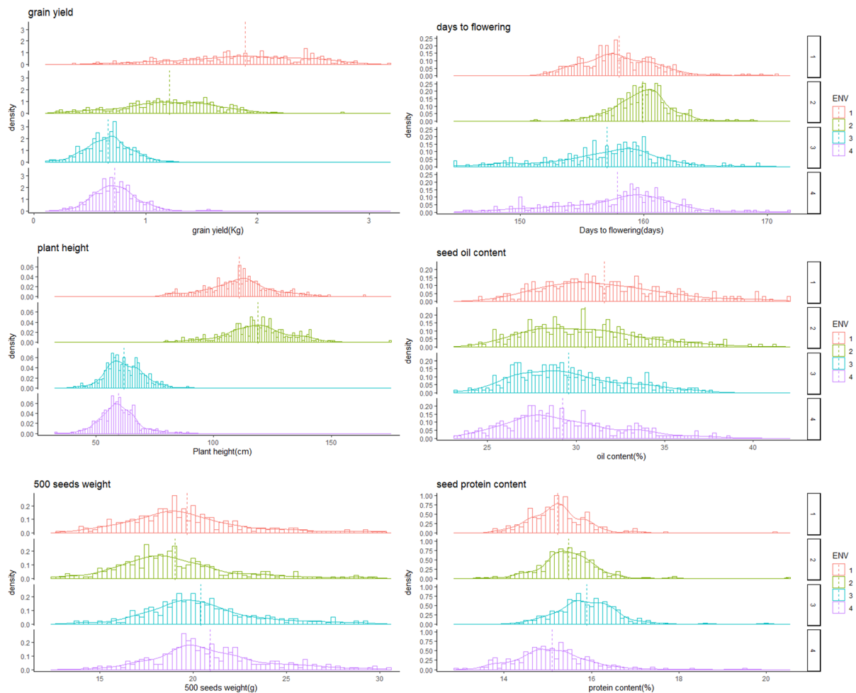
Fig. 1 Distribution of grain yield (YP), plant height (PH), days to flowering (DF), 500 seed weight (SW), seed protein (PR), and oil content (OL) among the 406 safflower accessions at each of the four field trial sites (ENV, dashed line shows the trait mean)

(0.34–0.479) and negatively correlated with PR (−0.208–−0.405). SW was negatively correlated with OL (−0.518–−0.505), PR (−0.55–−0.383), and PR was positively correlated with OL (0.19–0.639) over all sites. However, DF is positively correlated with PH at sites 1, 3, and 4 (0.464–0.62) and negatively correlated with PH at site 2 (Table 1).