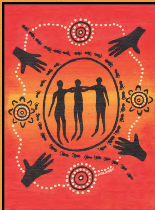
Cover Artwork by Sharon Kirby – from the Barkindji people on the New South Wales side of the Murray River