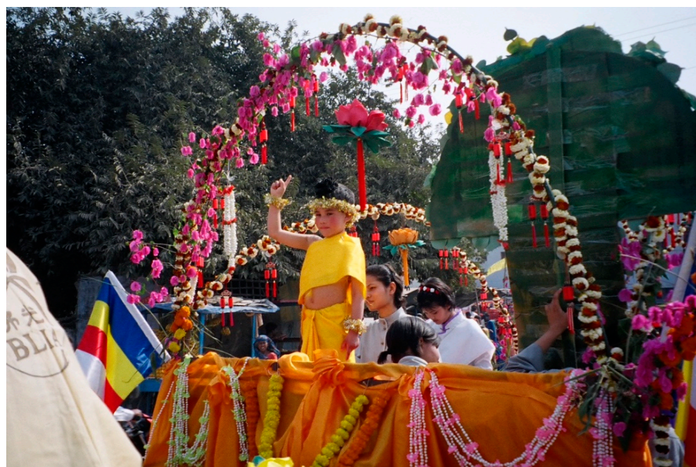
Figure 1. Procession and re-enactment of events in the Buddha’s life by school children during Vesak in Bodhgaya.

Vesak . (S. Vaiśākha; P. Vesākha; T. Sa ga zla ba): Based on the ceremonial cycle of Buddhist holidays, especially following the Theravada and Tibetan tradition, the foremost calendrical ritual is that of Vesak (also referred to in vernacular terms as Buddha Purnima or Sawa Dawa in Tibetan). This full-moon day falls on the fourth lunar month of the traditional Indian calendar (usually corresponding in April–May) and commemorates three important events in the life of the Buddha: his birth, awakening, and parinirvāṇa . Although widely celebrated in many parts of Asia, especially in South East Asia, it takes on particular significance in the holy land and is frequently combined with other meritorious actions (see below). On this occasion, numerous functions and rituals are arranged to honor the memory of the Buddha, such as elaborate processions through the surrounding town toward the main temple or stupa (Figure 1). This event is usually organized and planned by local monastic councils and temple committees. Although the date of Vesak has become standardized in contemporary India and in many ways has become a symbol of unification for the different monastic groups and lineages in Buddhist sacred places, it is important to keep in mind that the actual date and symbolic importance of Vesak varies considerably amongst Buddhist communities. 4