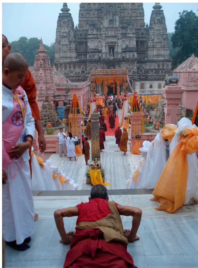
Figure 4. Full-length prostration before the Mahabodhi temple, Bodhgaya.

Meditation: We use the English term meditation to refer to a range of more specific techniques and practices that express forms of restricted bodily movement that bring about physiological changes and encourage an altered state of consciousness which is amenable to spiritual development. The two most prominent forms of Buddhist mental cultivation that are used for concentration purposes and to focus the mind are calming meditation ( samatha ) and insight meditation ( vipasyana ). Although the various forms of meditation are not directly associated with pilgrimage rituals, they are increasingly prevalent at sacred sites and are suggested to play an important role, especially among Mahayana Buddhists, as means of enacting one's Buddha-nature that can also be interpreted as a form of veneration toward Shakyamuni and the Dharma. This is especially the case in Bodhgaya where pilgrims can be found throughout the Mahabodhi temple complex in quietude and stillness. Although it has been emphasized that these meditation techniques were rarely practiced by laity in the past, today, they figure prominently in the ritual ecology of sacred sites among individuals and groups as a means of removing mental impurities and cultivating techniques that speak to Buddhist aspirations of achieving Nirvana across a wide spectrum of practitioners.