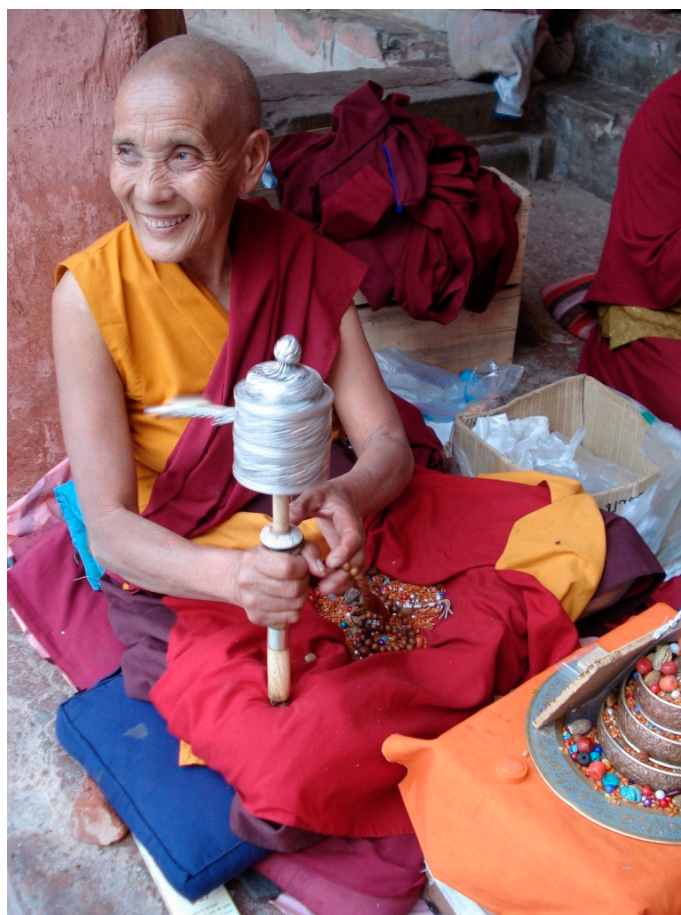
Figure 3. Tibetan nun with prayer wheel outside Mahabodhi Temple. (Photo from the author).

Prostration: (P. panipāta , S. namas-kara ) This is a common gesture of deep respect used among Buddhists to show reverence to the Triple Gem (three times) and a common practice of veneration at sacred sites that helps to accumulate merit. Although the type of prostration and accompanying prayers vary across Buddhist traditions (such as half and full length with emphasis on different verses), it is quite common in pilgrimage sites to see Buddhists prostrating along a circumambulation path or before a particular image, teacher, or stupa (Figure 4). In the Pali Canon, there are several suttas that mention laypersons prostrating before the living Buddha (Mills 1982). The action, when it involves dropping the entire body forward and stretching it full length on the ground, also requires considerable physical and mental effort. For these reasons, prostrations, like forms of meditation (see below), can be interpreted as a means of purifying one's body, speech, and mind of karmic defilements to further progress along the path to enlightenment. 6 For example, in the northwest corner of the Mahabodhi temple complex, during the winter season, it is common to see hundreds of maroon-clad monks performing full-length prostrations on long wooden boards in sets of a hundred thousand over several weeks and months in an effort to complete their preliminary practices.