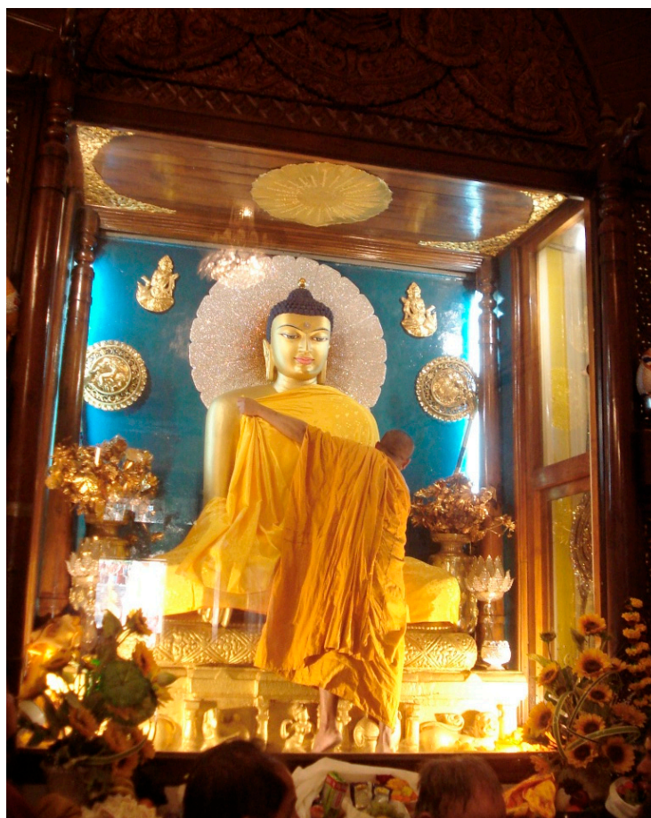
Figure 8. Offering robes to the main Buddha image in the Mahabodhi temple.

As we see in this section, providing Dana and accruing merit can be expressed in a range of ritual forms, from the recitation of certain verses, offerings to the sangha, donations, and social work, to name a few. Although there are multiple modalities for the transference of merit, one could argue that undertaking pilgrimage itself represents one of the highest forms of merit-making in the Buddhist world given the ways in which other ritual practices are enfolded within the journey. For these reasons, pilgrimage places are very auspicious locales for undertaking virtuous deeds which are akin to a merit multiplier effect.