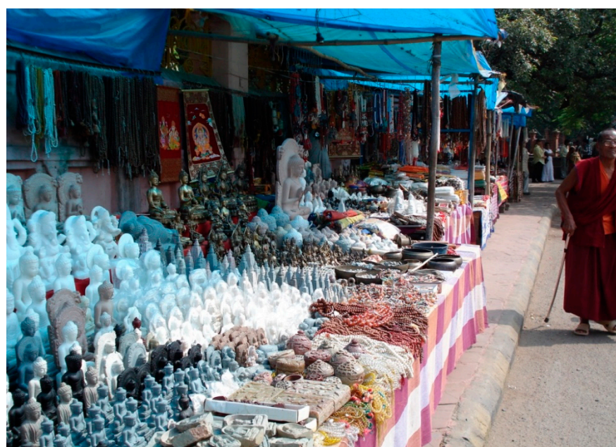
Figure 9. Sacred souvenirs on display in the bazaar, Bodhgaya.