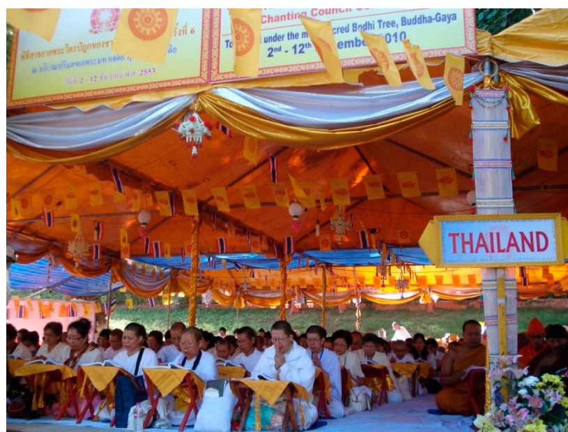
Figure 7. Thai participants in the International Tipitika Chanting ceremony in Bodhgaya.