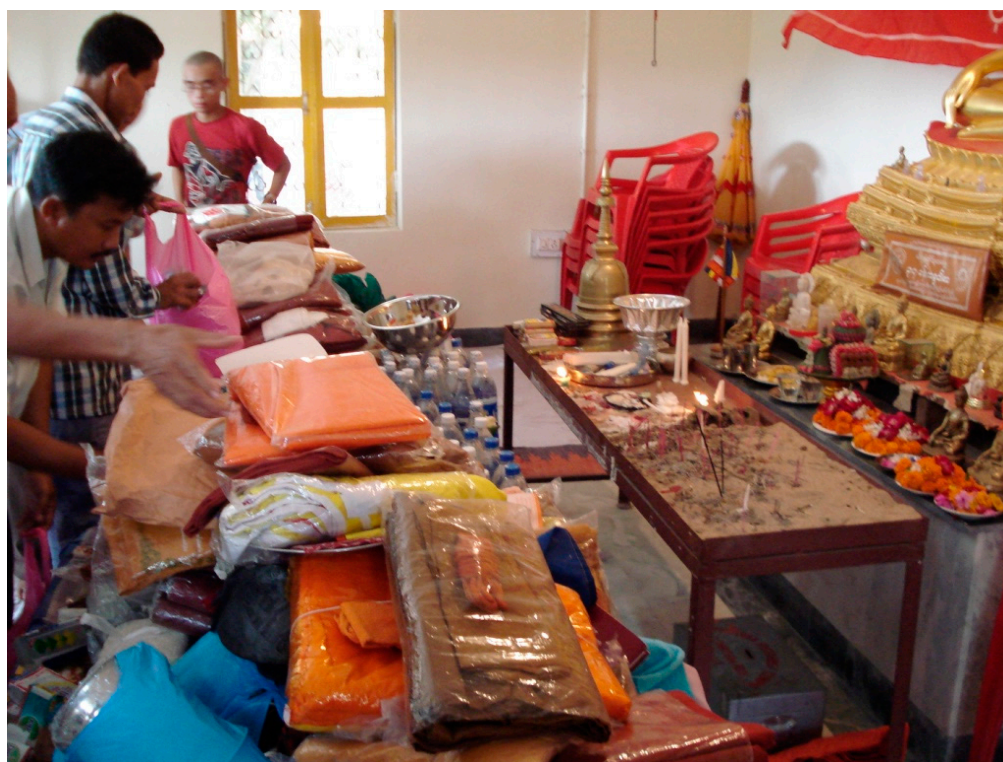
Figure 2. Offerings by lay pilgrims during the Kathina Dana at a nearby temple in Bodhgaya.

Kathina Dana : This refers to the “great robe offering” ceremony in the Theravada tradition that marks the end of the vassa (“rains”) retreats and is celebrated with many sanghadana ’s held between different local monasteries and temples, especially from South and South East Asia (Figure 2). On these occasions, lay pilgrims visit members of the sangha and offer cotton cloth for the purpose of making new robes, gifts, feasts, and donations to the temple to support the monks and nuns in their pursuit.