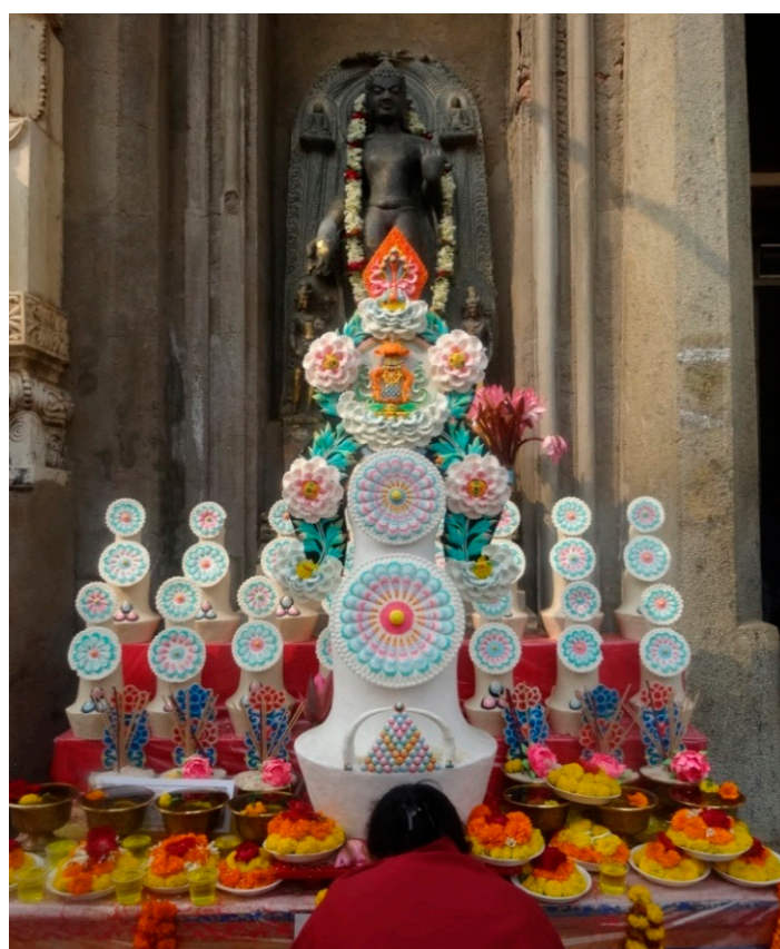
Figure 6. Tormas during the Monlam chanting in Bodhgaya.