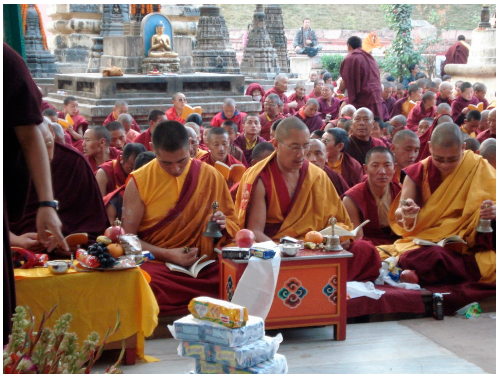
Figure 5. Monlam event under the boughs of the Bodhi tree in Bodhgaya. (Photo from the author).