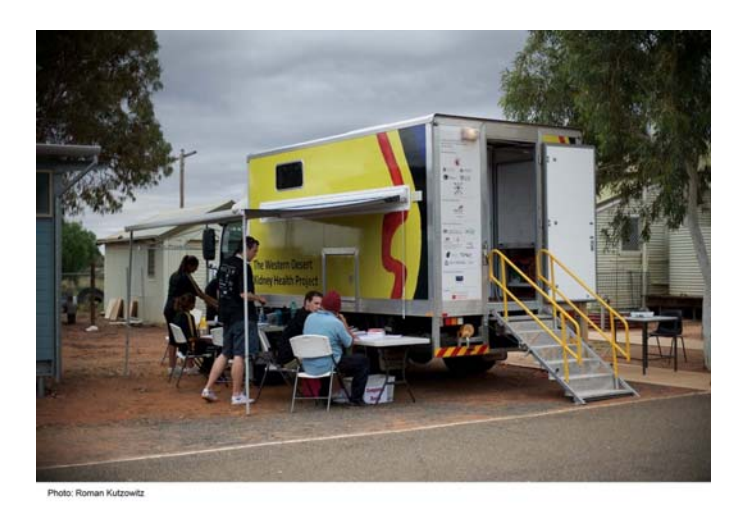
Figure 2: Western Desert Kidney Health Project Data collection in a remote Western Australian town.