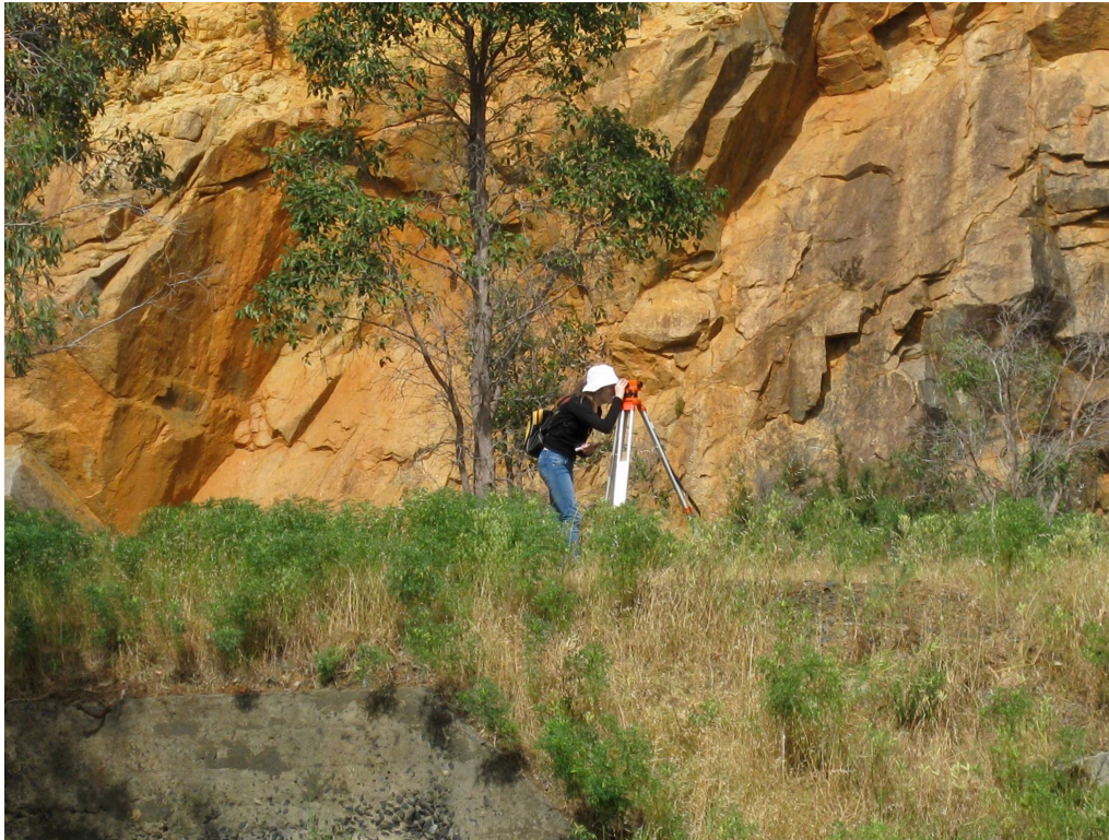
Figure 3: Student surveying the Statham's Quarry site

site survey methodology (see fig. 3), successfully gathering information on the layout and operation of the quarry, and associated industrial and residential buildings. The size of Statham's Quarry allowed students to be involved in assessing multiple features at the site and to record them accurately under supervision. Therefore, students applied their skills using a variety of archaeological tools and methods likely to be utilised by companies in the professional sphere.