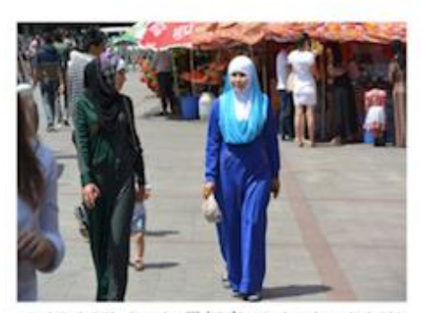
2. hijab [Ch. liqieke 里切克; Uy. hijab or lichāk]