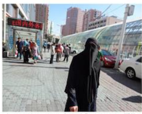
3. jilbāb [Ch. jilibafu 吉里巴甫 or zhaopao 單袍; Uy. jilbāb]