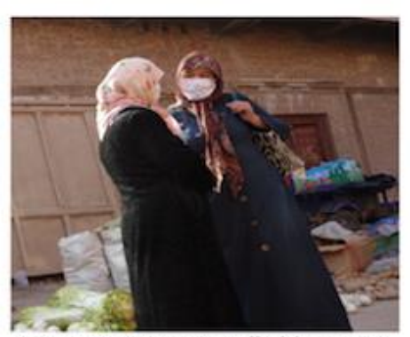
niqab [Ch. mengmiansha 蒙面沙; Uy. niqab, chümbäl or chümpärdä]