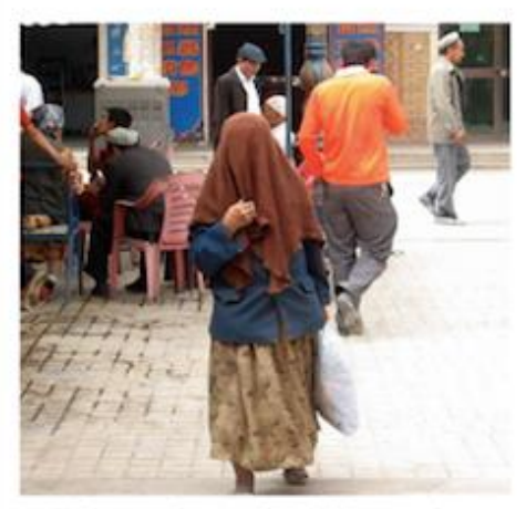
5. Kashgar-style netted veil [Ch. wangzhuang toujin 阿状头巾; Uy. tor romal]