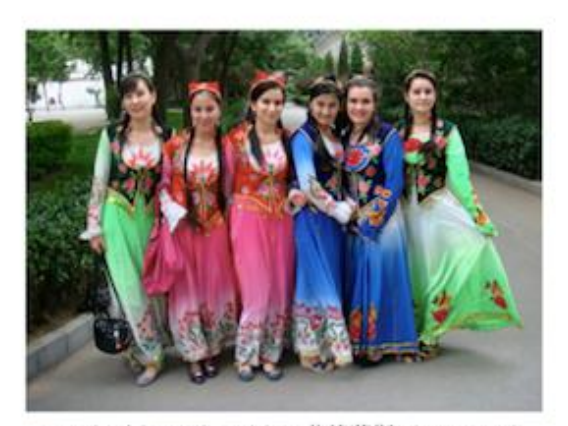
6. ātlās-fabric [Ch. aidelaisi 艾德莱斯] dresses and doppa hats [Ch. huamao 花帽]