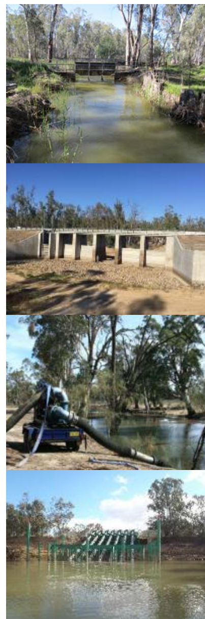
Figure 2. From the top: (i) regulator at Nestron Creek, (ii) Koondrook Forest regulator, (iii) pumping wetlands in the mid-Murray, (iv) Hattah Lakes pump.

A primary goal of using infrastructure for environmental watering is to achieve critical environmental flow targets