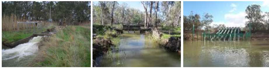
Figure 1. Examples of infrastructure used to deliver water into wetlands in the MDB.