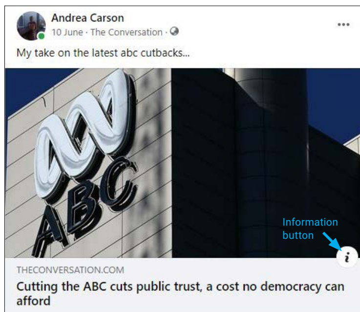
Figure 5.3: Facebook provides context to news posts using the info button

None of the digital platform experts interviewed for this project believed that the problem of online misinformation had been adequately tamed – yet. One platform expert cited the technical and temporal difficulties in addressing false content quickly: