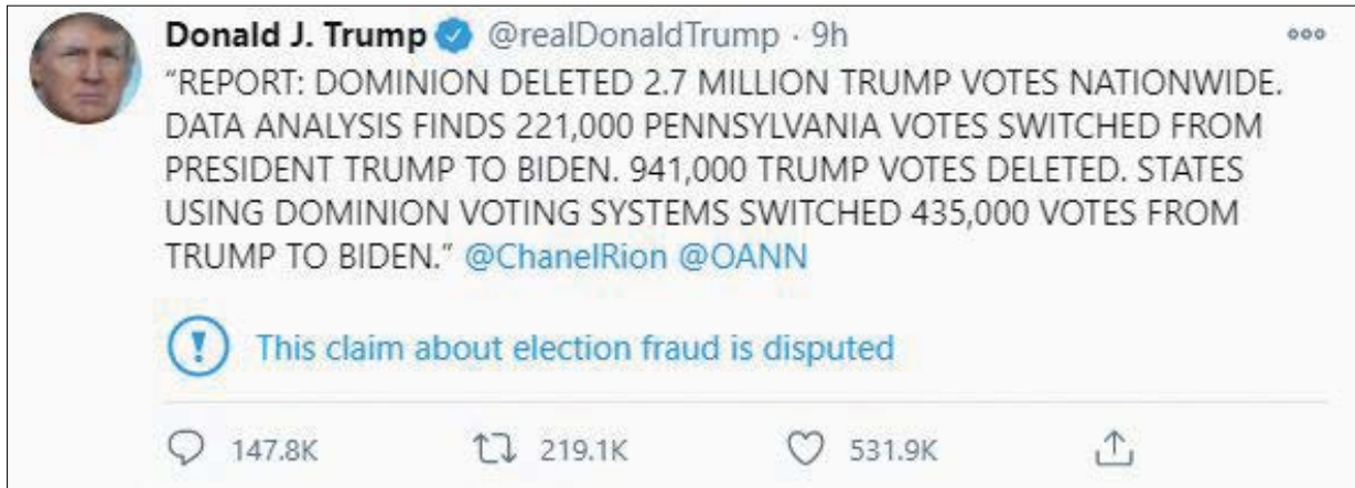
Figure 5.2: Donald Trump's contested Tweets