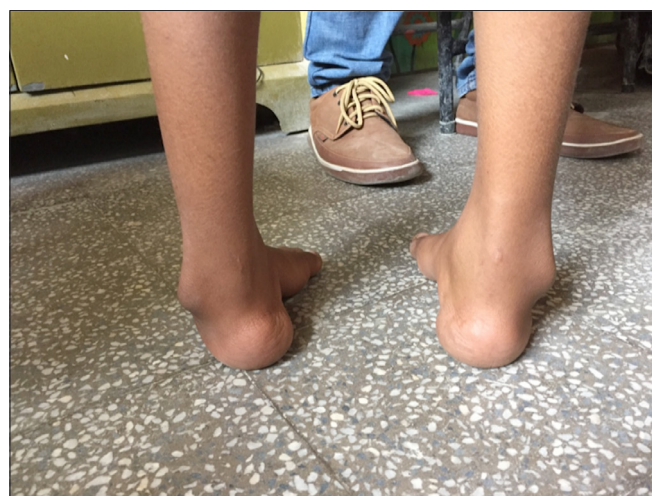
Figure 2: A partial relapse of clubfoot deformity where the feet were plantigrade, supinated, and the child walked independently.