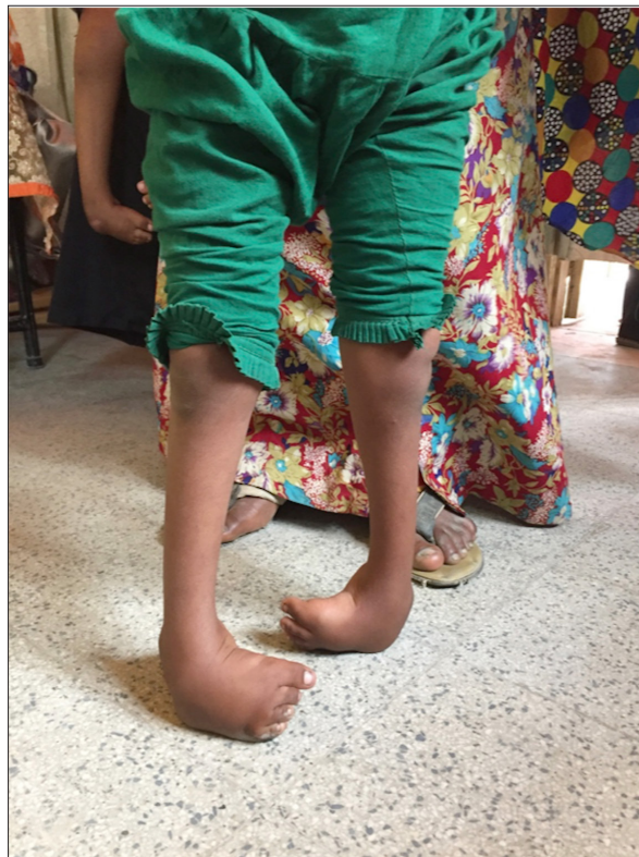
Figure 1: A fully relapsed of clubfoot deformity following incomplete treatment in a child age five years.

analysis (Table 3). The dependent variable which indicated deformity relapse was coded as 'Yes' is equal to 1 (n=15) and 0 was coded for no relapse (n=53). Since the dependent variable was discrete, logistic regression estimated the factors that are associated with relapse. The model evaluation of -2LL value for this model (21.94) and Omnibus test of model coefficients ( p < 0.05 ) supported the model. The Hosmer & Lemeshow test of the goodness of fit suggests the model is a good fit to the data ( p > 0.05 ).